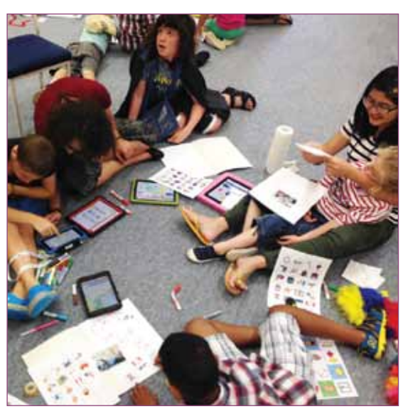
Maximising communication during fun activities.

'The benefits from camp were as good as three years' therapy.