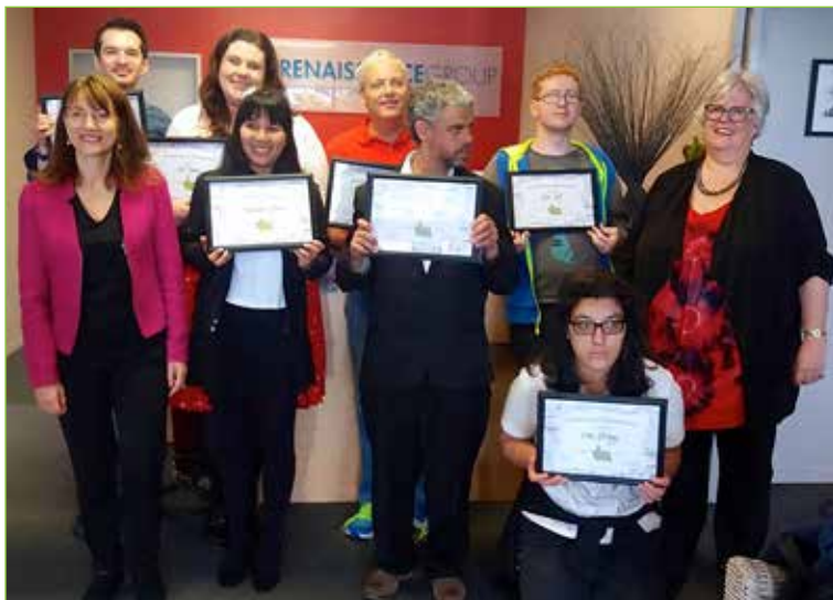
The Radio Gaga team.

Every presenter lives with a disability and this is the foundation that makes Radio Gaga supreme. Usually disabled people’s voices are unheard on mainstream radio. Radio Gaga is breaking stereotypes and giving people with disabilities a self-directed environment to be heard.