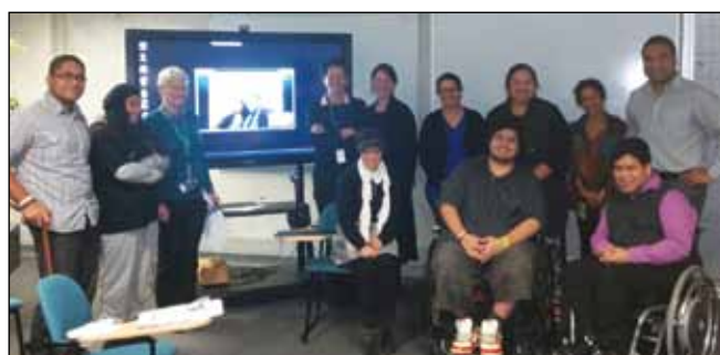
Pasifika Disability Research Advisory Group – July 2014