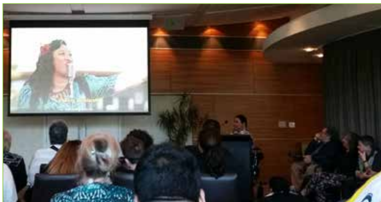
The launch of the music video SIVA at Te Papa

SIVA, which means dance in Samoan, is a Pasifika music video which celebrates people and encourages inclusion. The video shows disabled people as musicians, dancers and technicians behind and in front of the camera. SIVA gives a positive and 'can do' view of how disabled people can work, dance and enjoy themselves.