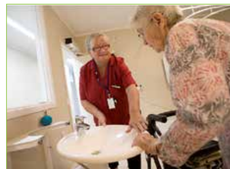
A demonstration of the pull-out sink.

For the first time customers, and those working in the health and disability sector, there will be a range of services available within the EASIE ( E quipment, A dvice, S ervices, I nformation, E ducation) Living brand, under one roof – a 'one-stop-shop'. The EASIE Living Centre is the latest innovation from Enable New Zealand, which has been providing disability support services for over 40 years, and reaches over 50,000 people a year.