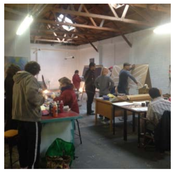
Network members creating work for their art exhibition September 2015.

'We think the network model is a powerful way to assist people to support each other and take control of their own support,' says Jo.