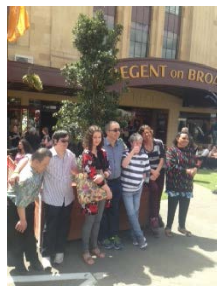
Network members receiving 2nd prize in the Palmerston North City Council PassionArt Awards 2015.