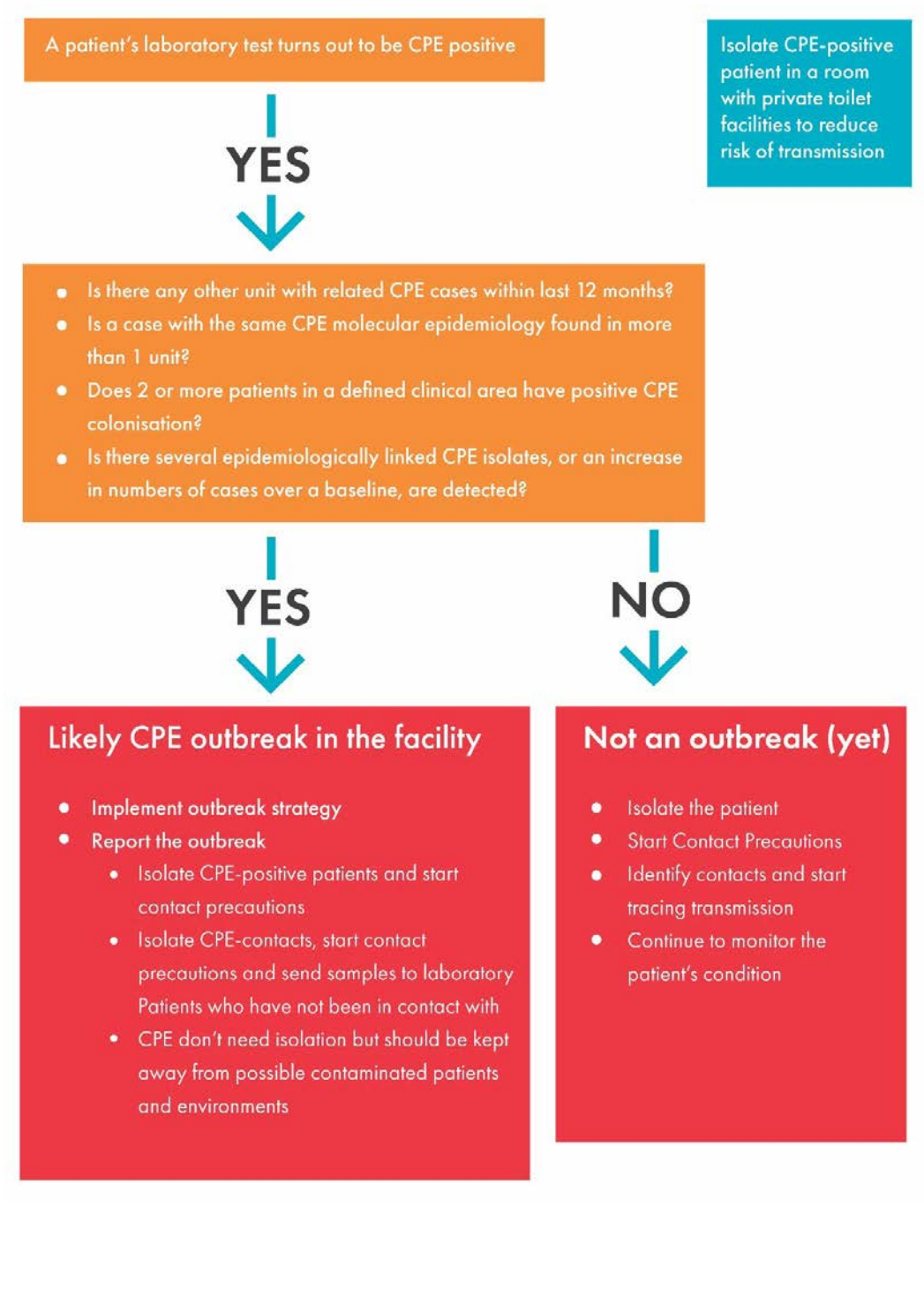
Figure 3: Flow chart for determining whether there is an outbreak or not