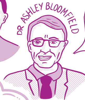
DR ASHLEY BLOOMFIELD

IF people UNDERSTAND WHY - They will do EXTRAORDINARY THINGS