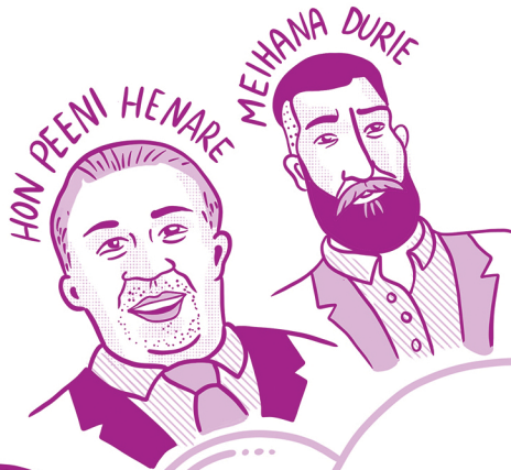
HON PEENI HENARE