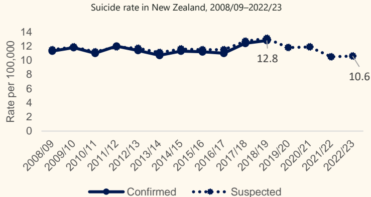
Figure 1. Confirmed and suspected suicide rates for New Zealand, 2008/09–2022/23

Data for the two most recently available financial years (2021/22 and 2022/23) shows that the average rate of suspected suicide has decreased by 10.6% from the historical average for the previous 13 years of data (2008/09 to 2020/21). However, this was not a statistically significant decrease.